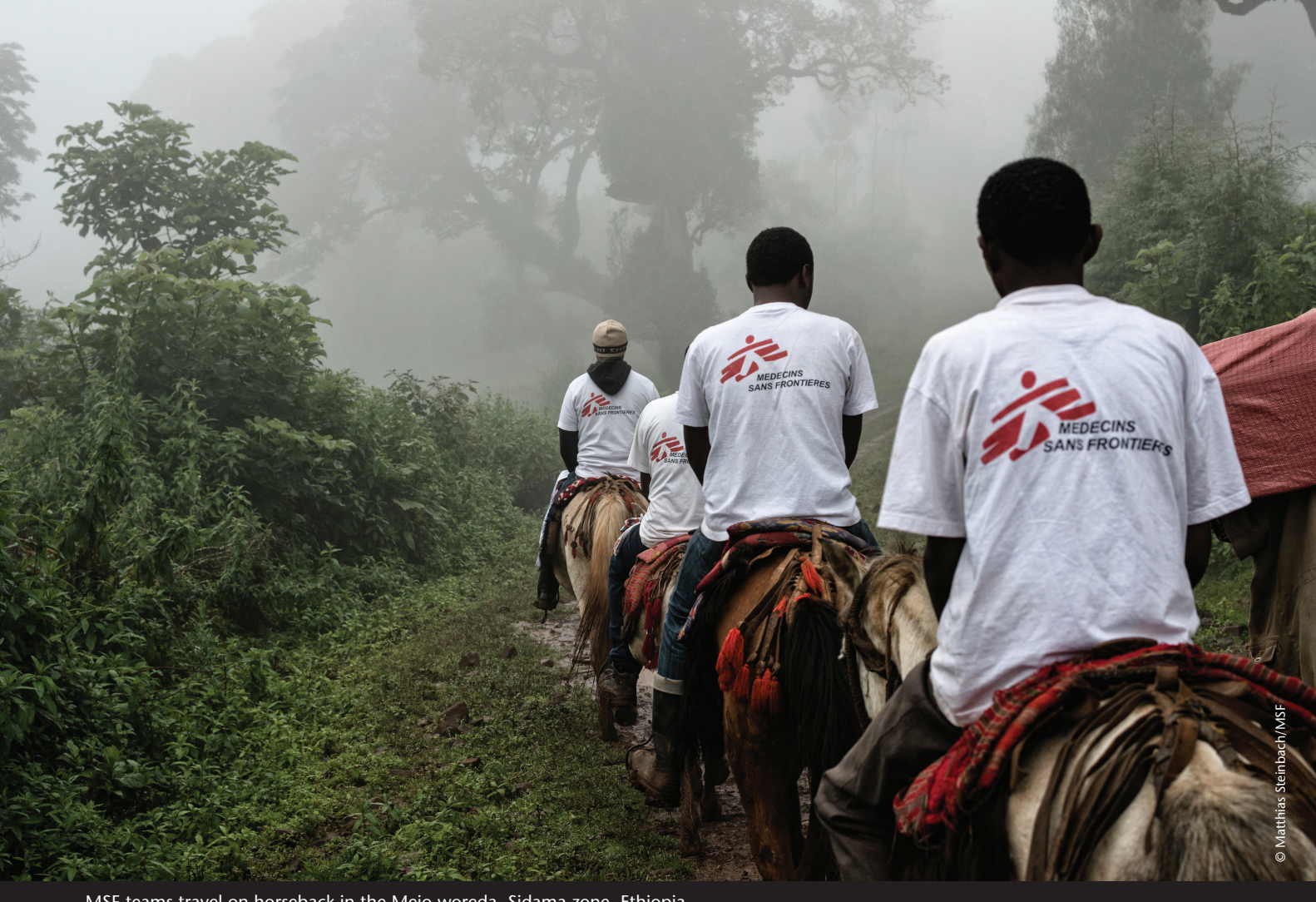
MSF teams travel on horseback in the Mejo woreda, Sidama zone, Ethiopia.