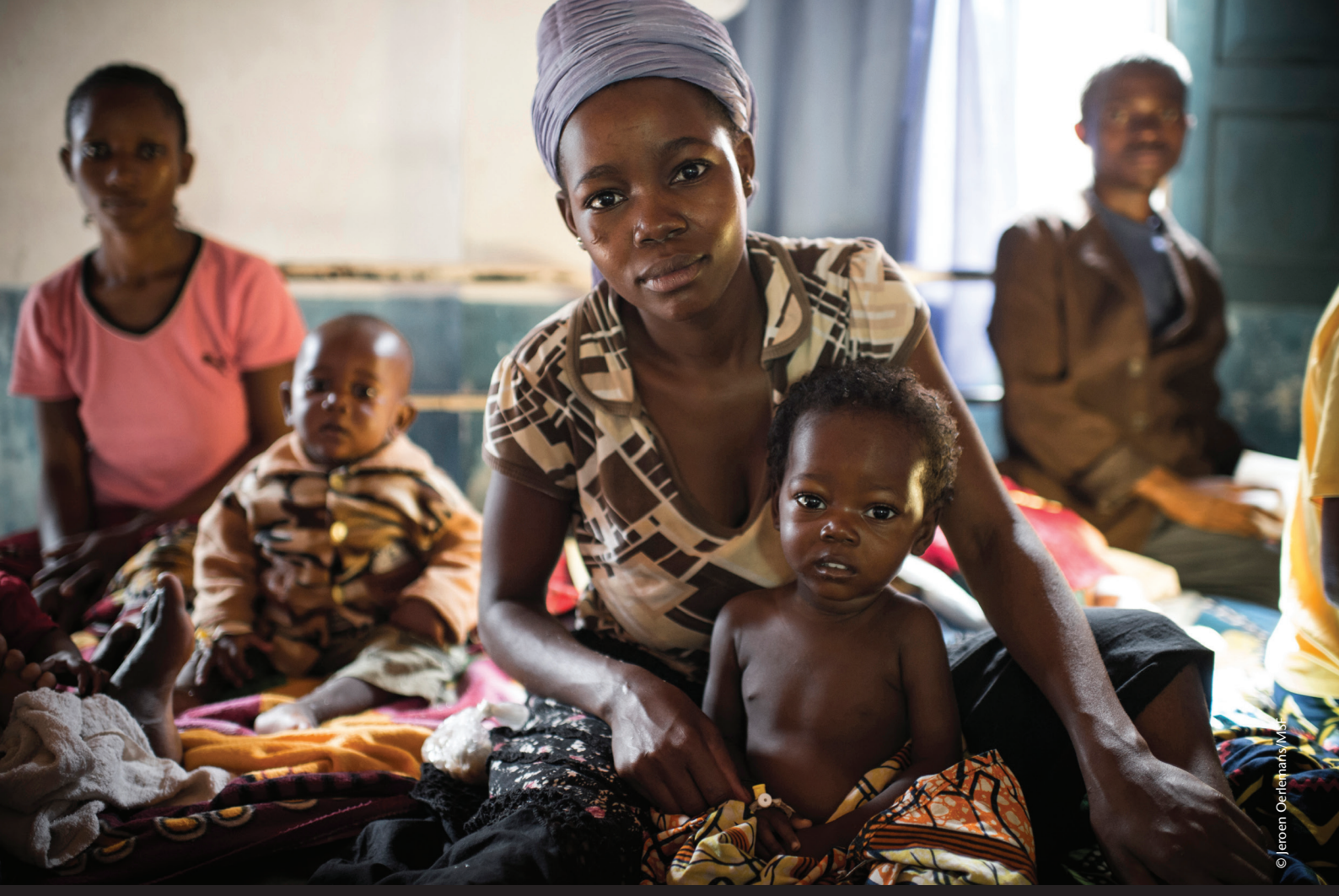
On the paediatric ward of Baraka hospital, South Kivu, Democratic Republic of Congo.